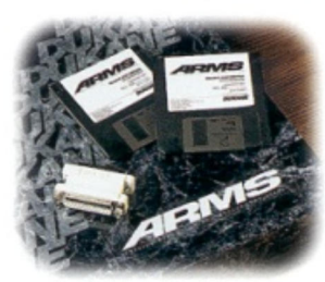
ARMS Reporting Software