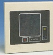
Single Call Cord Station