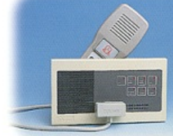
Dual Pillow Speaker Station