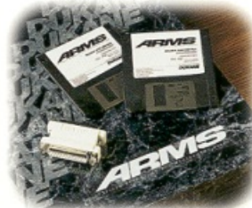
ARMS Reporting Software