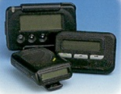
Pocket Page Integration

A shared system platform, combining the key features and benefits of both Dukane's ProCare 2000 and ProCare 6000, sets the ProCare 2600 Solution apart from its competition. It offers facilities unmatched features, flexibility, and growth. Wireless telephone and pocket page integrations are greatly enhanced