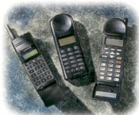
Wireless Telephone Integration