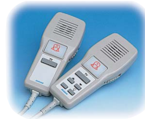
Choice of Pillow Speakers