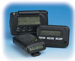
Pocket Page Integration