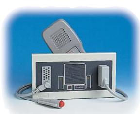
Dual Pillow Speaker Station