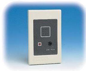
Duty Tone Station