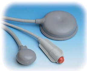
Choice of Call Cords