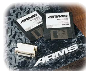
ARMS Reporting Software