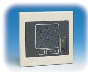
Single Call Cord Station

website: www.dukane.com e-mail: csdmarketing@dukane.spx.com