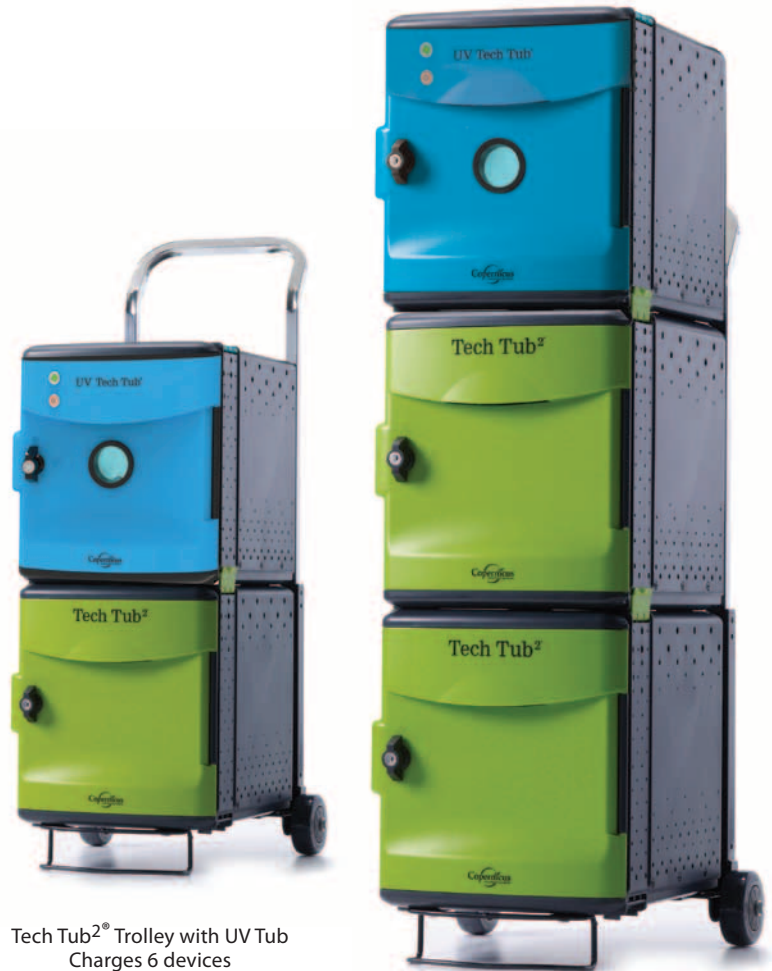
Tech Tub 2 ® Trolley with UV Tub Charges 6 devices

The green tubs charge different quantities of Chromebooks™, iPads® and other tablets.