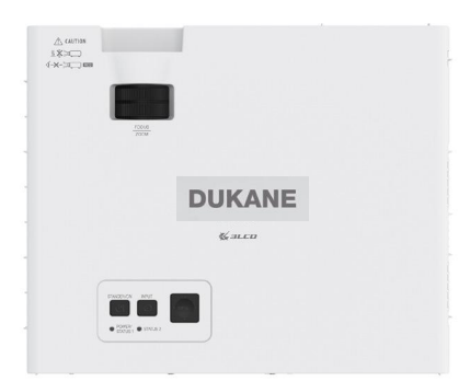
I de Ara